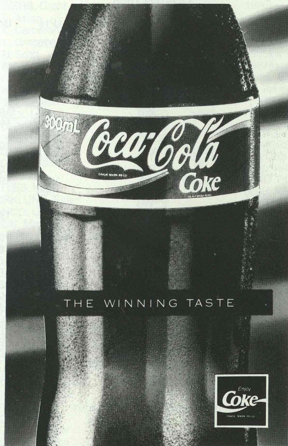
"COCA-COLA" AND "COKE" ARE REGISTERED TRADE MARKS WHICH IDENTIFY THE SAME PRODUCT OF THE COCA-COLA COMPANY. THE DYNAMIC RIBBON DEVICE IS ALSO A REGISTERED TRADE MARK OF THE COCA-COLA COMPANY.