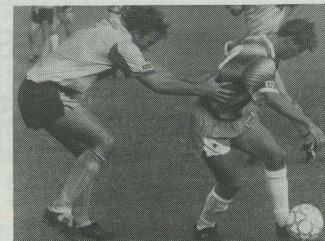
Two of the clubs returning to the 2nd Division - Inala City and Mt Gravatt

The big achievers last year were Brighton who, but for the incredible number of draws, would have been promoted, will again be a big threat. Promoted Brothers United now playing at a new venue at Toowong, may well surprise a few teams in this Division, as they are not short on quality. Clairvaux who struggled almost all of 1993, can expect little change from some of the clubs in this Division, and could find '94 equally as difficult. Relegated Darra United will hope that '93 disappears into the dim, dark past very quickly, nine points adrift of safety could take a little erasing in the minds of the players. Expected to struggle yet again. The same could almost be said for Ipswich City who had a very long and arduous '93, missing relegation by only one point - should do better