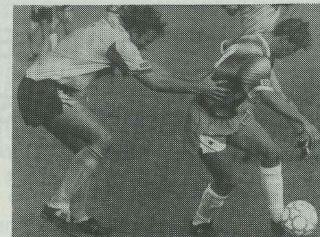
Two of the clubs returning to the 2nd Division - Inala City and Mt Gravatt

The big achievers last year were Brighton who, but for the incredible number of draws, would have been promoted, will again be a big threat. Promoted Brothers United now playing at a new venue at Toowong, may well surprise a few teams in this Division, as they are not short on quality. Clairvaux who struggled almost all of 1993, can expect little change from some of the clubs in this Division, and could find '94 equally as difficult. Relegated Darra United will hope that '93 disappears into the dim, dark past very quickly, nine points adrift of safety could take a little erasing in the minds of the players. Expected to struggle yet again. The same could almost be said for Ipswich City who had a very long and arduous '93, missing relegation by only one point - should do better