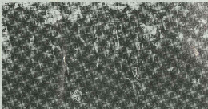
The Toowong 5th division side - promotion to 3rd division their aim.

"Obviously we are pleased with the way things have gone so far and can see a positive future," Mr