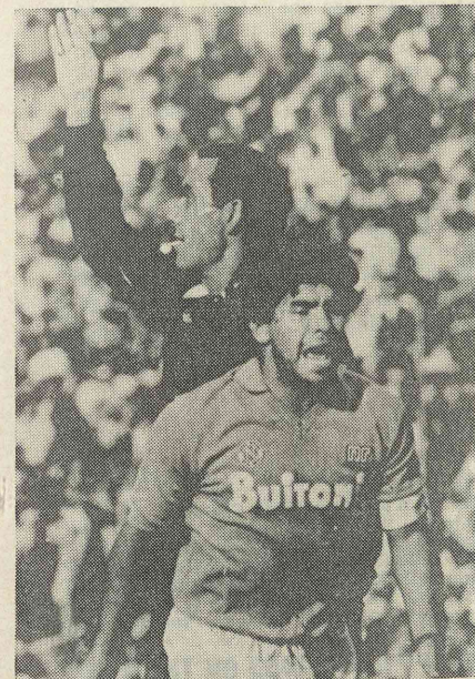
Even the world's greatest player, Diego Maradona, has problems with referees.