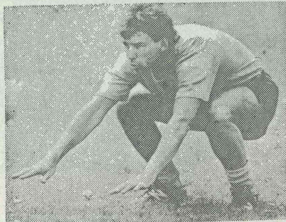
England and Manchester United captain, Bryan Robson, who could play for Queensland in the annual interstate clash against New South Wales at Perry Park next month.

And the team Queensland soccer followers want most to see at Perry Park? Despite their poor season, it was Manchester United (42%), followed by Liverpool (26%), Everton (22%). Others named included Arsenal, Napoli, Glasgow Rangers, Celtic and Feyenoord.