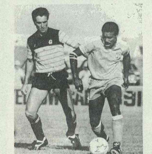
Action from Queensland's opening match against Fiji.

It is also incorrect that we look for opponents our state team can