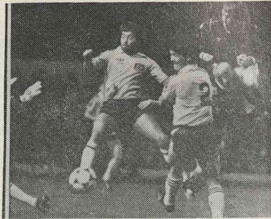
Action from last year's Hampden Park match where the Kenny Dalgleish-inspired Scots found the Socceroos a tough nut to crack.