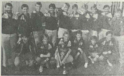
The Queensland youth team which won the national youth championship in Melbourne last year.