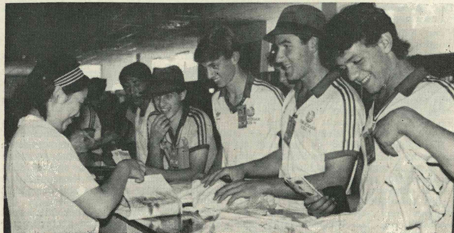
Some of the Australian under 16 team go shopping in Tianjin during a break in the inaugural tournament. The Young Aussies have become heroes in the eyes of the local Chinese.