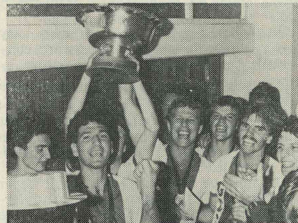
Happier and more successful times for Olympic.

It undoubtedly looms as a great way to spend Saturday!