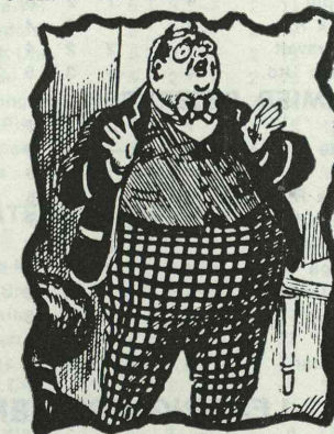
THE "OTHER" BILLY BUNTER