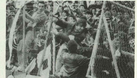
Nothing is sacred to the soccer thug and rioting fans will destroy any obstacle in their way.

If the British Government does not take grave and immediate measures to curb hooliganism, it will have failed in its duty to protect the citizens of this country. To persist any longer in laying the blame on football, the once beautiful national sport that is now dying a slow and painful death, would be an act of shameful irresponsibility.