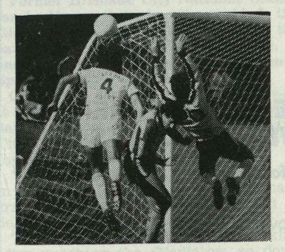
clash like this one above, between Ipswich United and Mount Gravatt could be a National League Second Division game if the NSL gets its way.

Clubs which would be likely candidates for an NSL Second Division include