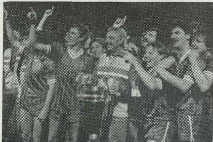
Liverpool manager Joe Fagan holds the European Cup after his team Liverpool beat AC Roma on penalties in the final in Rome. The group is pointing to the loyal band of supporters who made the trip to Italy.

Let's hope the ticket No. 80753 — No Go — comes up for the three of us.