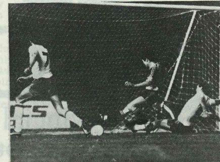
Action from last year's Lang Park match between Australia and England. Soccerer Alan Davidson tries to clear as Paul Walsh scrambles in the England goal, while John Gregory (No. 7) watches.

of the Ampol Cup on June 16 and 17 — a straight knockout to be included in the final 16 to go into an FA Cup-style draw for the first time ever.