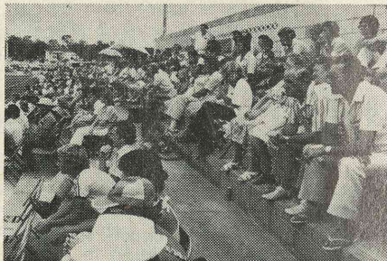
This was how Brisbane Lions started out. Now the club has a more than adequate clubhouse. Many clubs in the Premier League face similar long hard slogs to get the facilities required for the new competition.

Having a team in the top Queensland competition is a great benefit for the