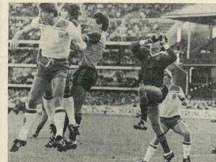
Action from last weekend's clash between Australia and England at the Sydney Cricket Ground.

England manager Bobby Robson was critical of both his own side and of the Australians.