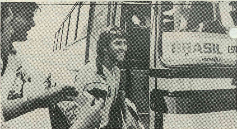
Brazilian world cup soccer star Artur Antunes ZICO who is rated by the new Brazilian coach as his ideal player — he has tenacity, dedication and style.

But he added, "none of them should worry us. We have more ability, and with a little more participation on defence and the attack, no one will beat us."