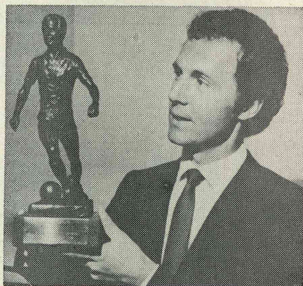
World famous West German FRANZ BECKENBAUER with a trophy given to him in recognition of his contributions towards the development of American Soccer.

The League has been divided into three divisions of four teams each. The Eastern Division has Chicago, Montreal, the Cosmos and Toronto; the Southern Division has Fort Lauderdale, Tampa Bay, Team America and Tulsa; and the Western Division has Golden Bay (formerly San Jose), San Diego, Seattle and Vancouver.