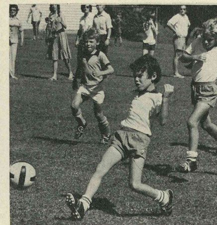
This shot is typical of the action in any one of many junior soccer games throughout the state each weekend. Junior soccer boasts more participants than any other football code.