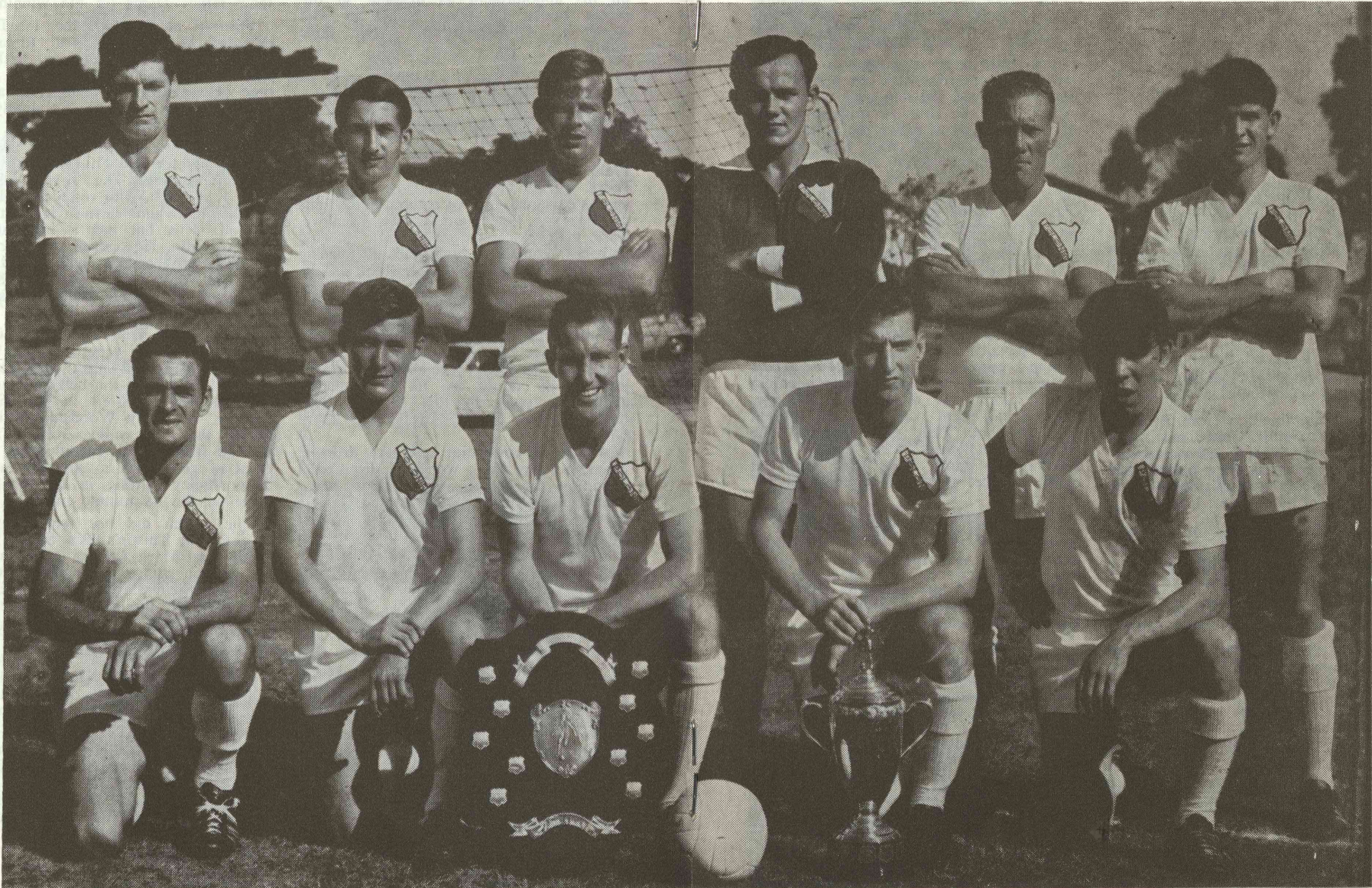
THIS is the Polonia team of 1968 which won the second division premiership and secured promotion to the first division, where the club has been ever since.