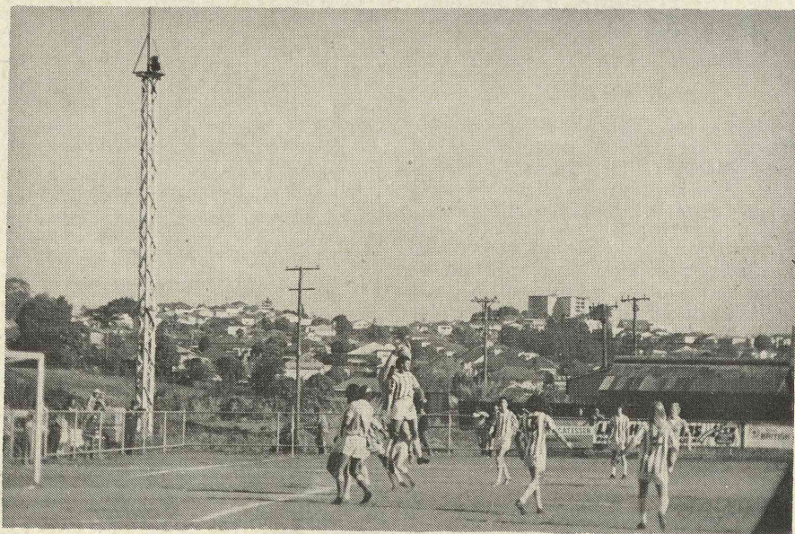
BRISBANE CITY v ST. HELENS

"If Ipswich overall does not aim at National League then it will remain as a second rate force. Maybe there is some hope for this venture same time in the future, but for the moment, the two Clubs will continue to go their separate ways."