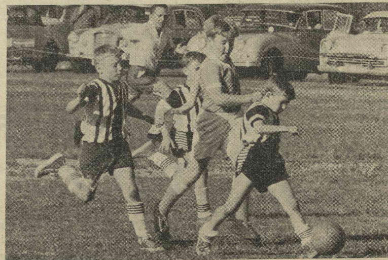
Action at half time of the Thistle - Merton match at Heath Park on Sunday — the two Under 9 Junior teams battled out a beauty while the older boys were "having their lemons."