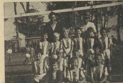
Winners of Consolation Competition REDCLIFFE U8B

An S.O.S. If any club have any Soccer '69 for 18th July containing the photo of a Beaudesert team, if you would ring me at 55 1102 I will be only too happy to take them off your hands.