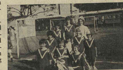
REDCLIFFE'S JUNIOR CHEER SQUAD