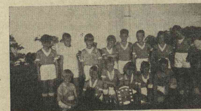
Joint winner of "Action Insulations" Shield HOLLANDIA