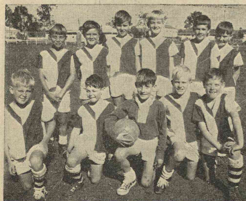
BEAUDESERT U10 YEARS