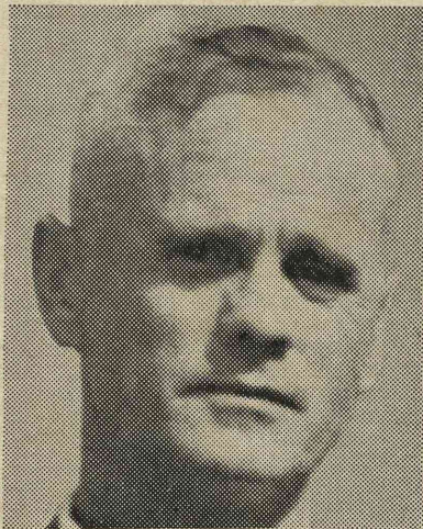
RAGS TATTERS Queensland's Coach

Who is going to win? Come along to the Ekka on Sunday and see for yourself.