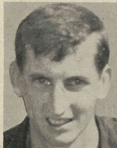
COL SMITH Ipswich Star

Hollandia must start as odds-on favourites but the underdogs Coalstars showed last week they still have a lot of fight left in them.